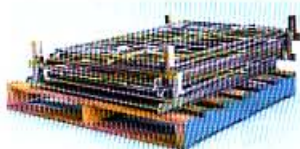
Dismantled For Storage