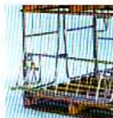
Half Drop Front