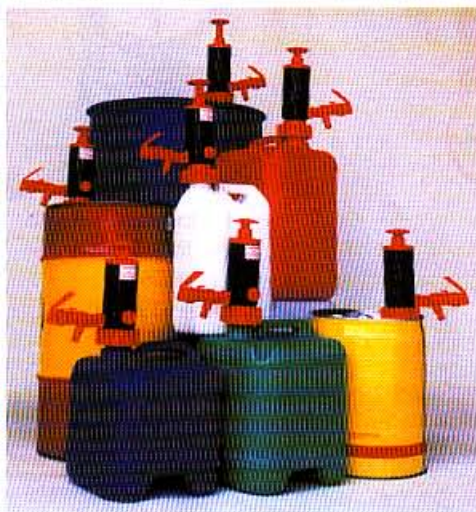
Each pump assembly comes with seals and tubing to fit almost any drum on the market