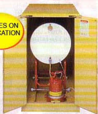
Safety Can Storage 160 litre, 1 shelf, 2 doors 6 x 20 litre drums REF AU25302